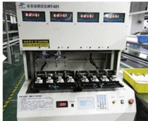
AUTO CODES TESTING INSTRUMENT