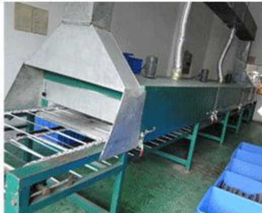
SILICONE BUTTON BAKE TOOLING