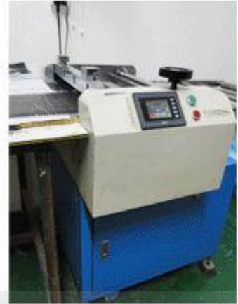
SILICONE CUT TOOLING