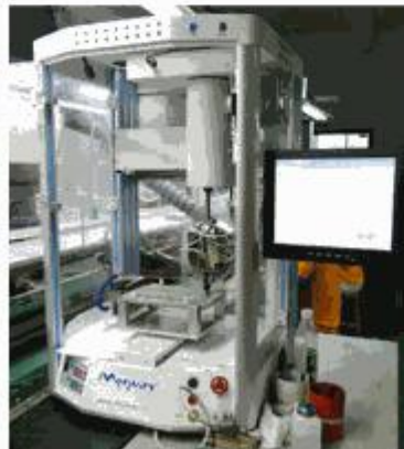
AUTO SOLDERING TOOLING