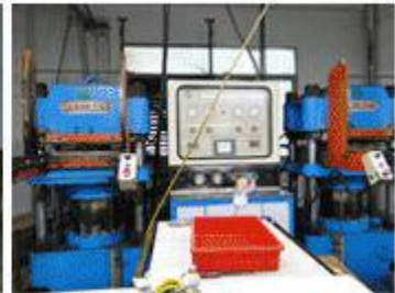
SILICONE BUTTON TOOLING