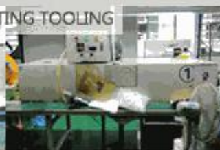
CASE PRINTING TOOLING