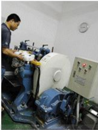
SILICONE MIXED TOOLING