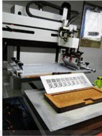
BUTTON PRINTING TOOLING